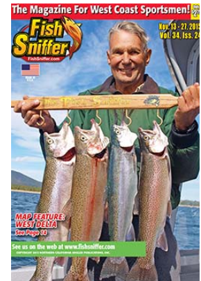
Latest Magazine Issue

When reports mention 'Sacramento Salmon,' they are often referring to the Sacramento River way up by Red Bluff or Woodson Bridge. What I'd like to focus on here is trolling for salmon in the vicinity of the City of Sacramento itself.